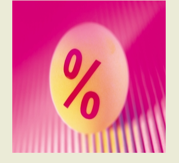
A grantor retained unitrust allows a discount for the value of the property transferred to the trust, while removing the property from the grantor's gross estate.