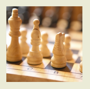
A more sophisticated business succession tool is a grantor retained annuity trust (GRAT) or grantor retained unitrust (GRUT).